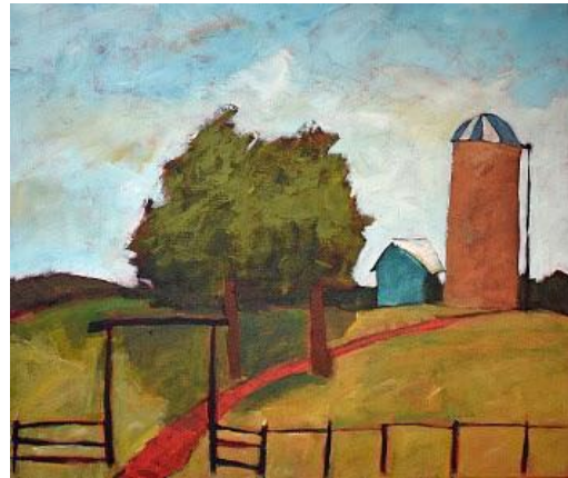
Jim Keffer, "Gate with Silo," Acrylic on Canvas, 24 x 28 in., $1700