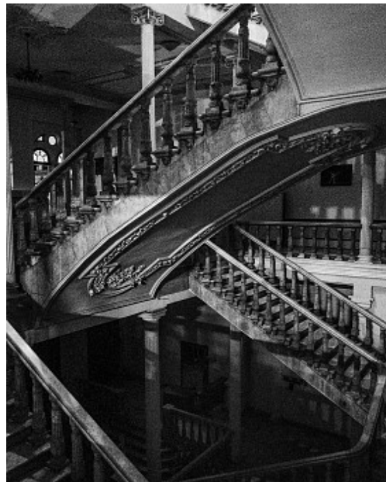
Catherine Adams, "Escuela Nacional Cubana De Ballet No. 12, Havana Cuba," 2017, Archival Pigment Print, 10 x 8 in., $500