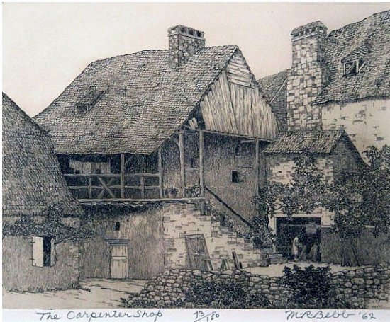
Maurice Bebb, "The Carpenter Shop," Etching, $290