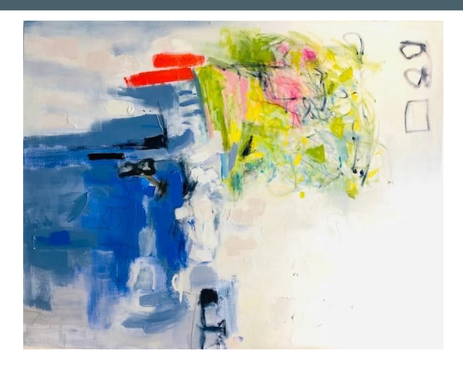
Beth Hammack, "Matisse Revisited," 2020, Acrylic on Canvas, 48 x 60 in., $3,200