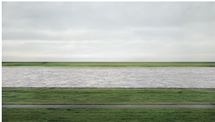
Andreas Gursky, "Rhein II," 1999, C-Print Mounted to Acrylic Glass, 74.8 x 141.7 in., NFS