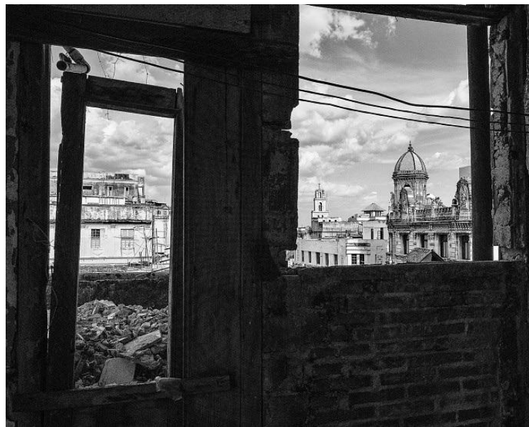
Catherine Adams, "The Acute Charm of Ruin & Development, Building 2.14 (Calle Amargura), Havana, Cuba," 2017, Archival Pigment Print, 8 x 10 in., $500