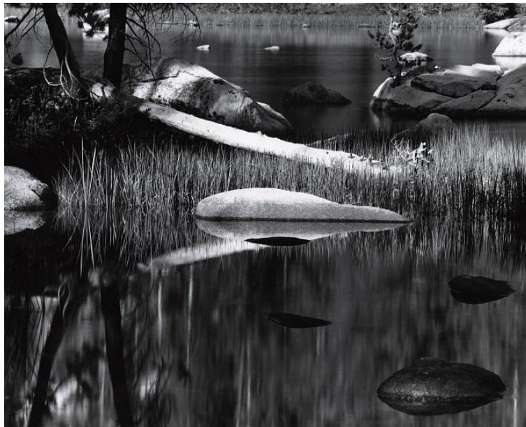
Brett Weston, "Untitled (Sierra Lake)," 1978, Silver Gelatin Print, 11 x 12 1/2 in., $4,000