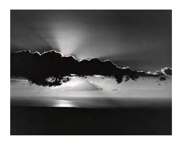
Brett Weston, "Untitled (Water and Clouds, Hawaii), ca. 1985, Gelatin Silver Contact Print, 11 x 14 in., $4,500