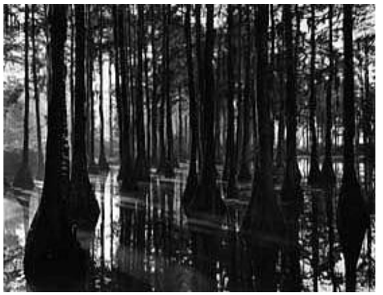
Brett Weston, "Untitled (Cypress Swamp, North Carolina), c. 1947, Gelatin Silver Contact Print, 10 3/8 x 10 in., $6,500