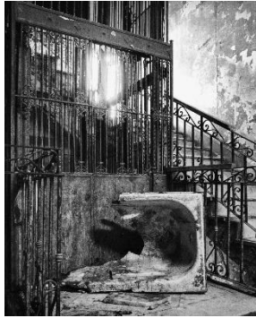
Catherine Adams, "The Acute Charm of Ruin & Development, Building 3.5 (La Habana Vieja), Havana Cuba," 2017, Archival Pigment Print, 10 x 8 in., $500

"In neo-classical ruin paintings, the bathing springs often abuts the beautiful architectural remnant."