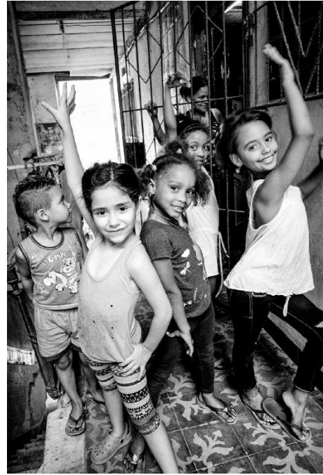
Catherine Adams, "The Acute Charm of Ruin & Development 7.2 (Malecon), Havana, Cuba," 2017, Chromogenic Print, 36 x 24 in., $1,900

"Building crumble every day in Havana, with most left standing as-is. People from the neighborhood, and from outside it, come in when a building is on the edge of collapse. They strip the premises right down to sheering off the face. What is left hovers between dilapidation and a state of having been cleansed. It is frighteningly charming to an eye groomed in neoclassical ruin paintings of Pompeii and other mythic sites."