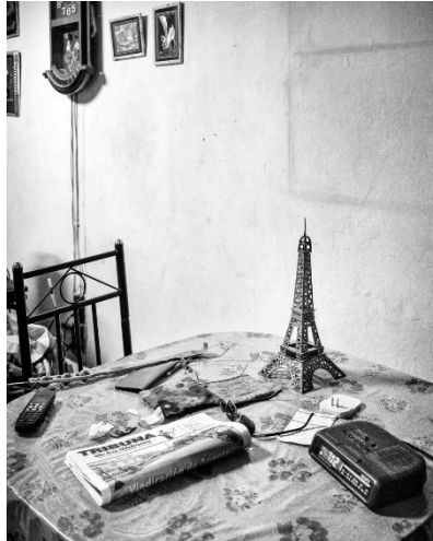
Catherine Adams, "The Acute Charm of Ruin & Development, Building 10.1 (Malecon), Havana Cuba," 2017, Archival Pigment Print, 10 x 8 in., $500

"In neo-classical ruin paintings, the bathing springs often abuts the beautiful architectural remnant."