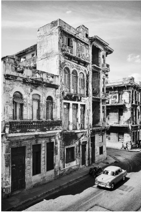
Catherine Adams, "The Acute Charm of Ruin & Development #5 (San Lazaro), Havana, Cuba," 2017, Chromogenic Print, 36 x 24 in., $1,900

"Building crumble every day in Havana, with most left standing as-is. People from the neighborhood, and from outside it, come in when a building is on the edge of collapse. They strip the premises right down to sheering off the face. What is left hovers between dilapidation and a state of having been cleansed. It is frighteningly charming to an eye groomed in neoclassical ruin paintings of Pompeii and other mythic sites."