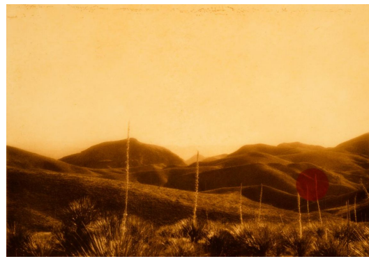
Christa Blackwood, "Cienega," 2013, Hand Pulled Black and White Analog Film Image Shot with Medium Format Film and Printed as Duo Mono Print Encaustic Photogravure on Kitakata Rice Paper, Edition of 9, 18 x 24 in., $2,750

Strange Fire's Interview with Blackwood Discussing Both Series