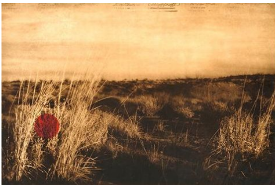
Christa Blackwood, "Chola," 2013, Hand Pulled Black and White Analog Film Image Shot with Medium Format Film and Printed as Duo Mono Print Encaustic Photogravure on Kitakata Rice Paper, Edition of 9, 18 x 24 in., $2,750

"This series was shot in West Texas and New Mexico over the course of several years and was hand printed as photogravures in 2013. All of the selected images were shot on black and white film and made into 18 x 24 in. photogravure etching plates. Once that was done, they were then inked, polished, and pulled through a flatbed press. After the prints dried for several days, the red dot was added with another pull through the press. After the red dot dried for a couple of weeks, a thin layer of encaustic wax varnish was done. The wax permeates through the thin kitakata rice paper, making the print almost transparent."